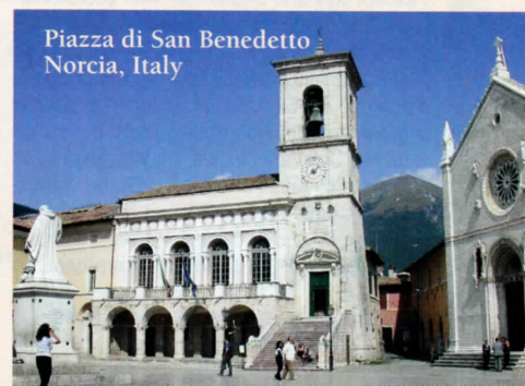
Piazza di San Benedetto Norcia, Italy