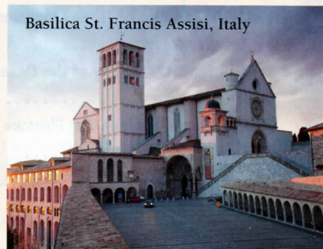
Basilica St. Francis Assisi, Italy